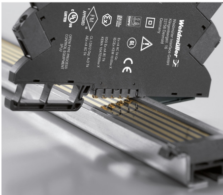
Power supply via CH20M DIN rail bus