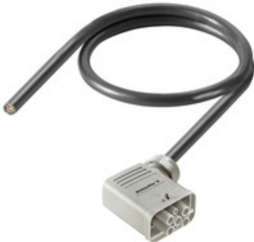
Product similar to illustration