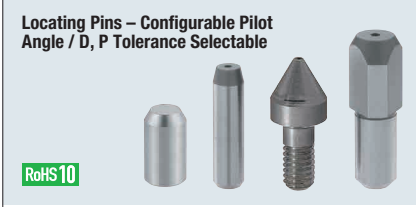
Locating Pins – Configurable Pilot Angle / D, P Tolerance Selectable