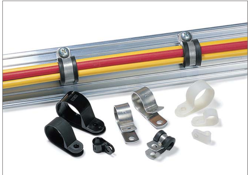
P-Clips manufactured in polyamide, aluminium, or aluminium with a chloroprene insert.

Manufactured from a high quality aluminium these P-Clips provide flexibility and yet give a permanent fixing in the most arduous environments. The addition of a Chloroprene insert provides the cable or pipe bundle with a high degree of protection against vibration, reduces noise and also offers electrical isolation.