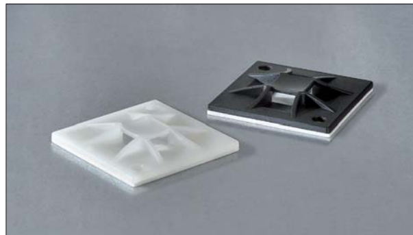
Q-mount QM, 4-way entry, adhesive/screwable.

Q-mounts allow a “4-way” entry for Q-ties and are available in a screwable or self adhesive version. Due of the special design of the mounting base, they offer a perfect solution in combination with the Q-tie cable ties. The Q-mount keeps the Q-tie in place during pre-assembly and ensures that the Q-tie does not slip out even in difficult situations, for example vertical mounting positions.