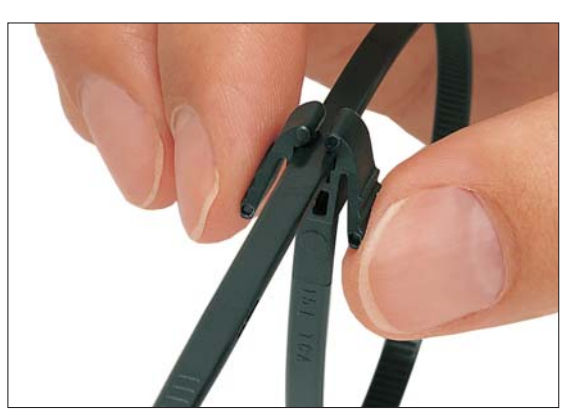
The REZ ties have a one-hand, simple, release mechanism.

These releasable and reusable ties are ideal for temporary installations or the addition and/or removal of cables. Suitable for a multitude of uses, such as the packaging industry as a bag closure where access to part of the bag contents may be needed but the bag needs to be re-sealed (example - milk powder in the catering industry).