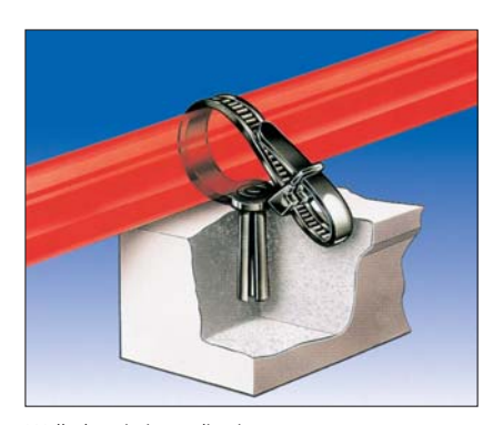
Wall plug tie in application.

Simply drill an 8mm hole and knock in the peg. Used to fasten cables, pipes or hoses in place.