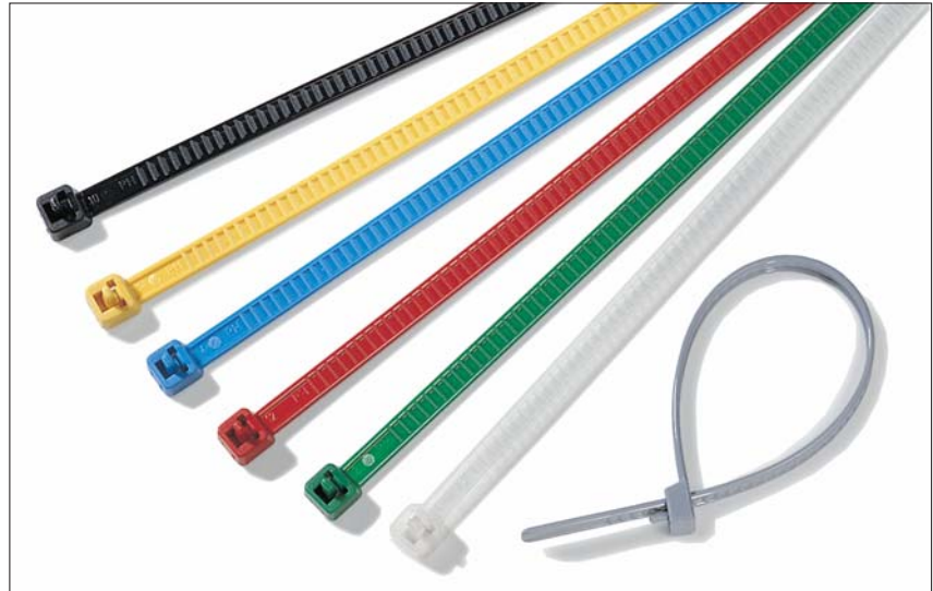
The LR55 cable ties are reusable and ideal for colour coding.

These releasable and reusable ties are ideal where temporary installation or the addition or removal of cables is required, for example: logistic identification (colour coding), packaging industries, cable harness manufacturing.