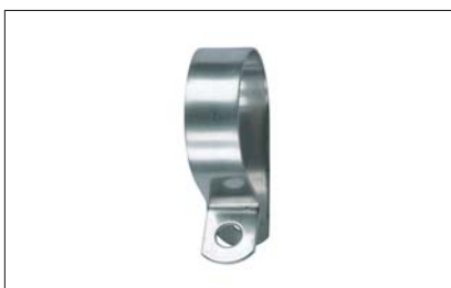
AFCSS Fixing Clip, Stainless Steel.