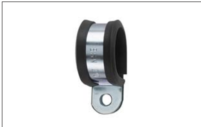
AFCS Fixing Clip, Stainless Steel and PVC Liner.