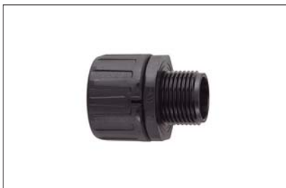
HelaGuard HG-S Straight, IP66.

Fittings with UNEF and NPT threads available on request. Please contact us!