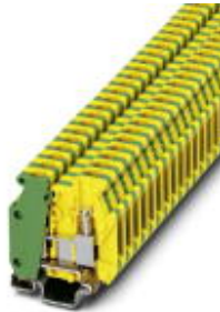
Ground modular terminal block, Connection method: Screw connection, Cross section: 0.2 mm 2 - 4 mm 2 , AWG: 24 - 12, Width: 5.2 mm, Color: green-yellow, Mounting type: NS 15

Please be informed that the data shown in this PDF Document is generated from our Online Catalog. Please find the complete data in the user's documentation. Our General Terms of Use for Downloads are valid ( http://download.phoenixcontact.com )