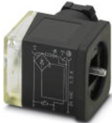
Valve connector, 3-pos., construction A, 1 LED, with protective circuit: varistor and rectifier, screw connection, M16 cable gland

Please be informed that the data shown in this PDF Document is generated from our Online Catalog. Please find the complete data in the user's documentation. Our General Terms of Use for Downloads are valid ( http://download.phoenixcontact.com )