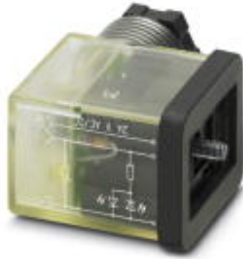
Valve connector, 3-pos., construction BI, 1 LED, with protective circuit, screw connection, M16 cable gland

Please be informed that the data shown in this PDF Document is generated from our Online Catalog. Please find the complete data in the user's documentation. Our General Terms of Use for Downloads are valid ( http://download.phoenixcontact.com )