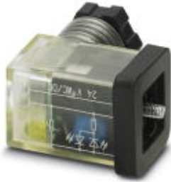
Valve connector, 3-pos., construction CI, 1 LED, with protective circuit, screw connection, M12 cable gland

Please be informed that the data shown in this PDF Document is generated from our Online Catalog. Please find the complete data in the user's documentation. Our General Terms of Use for Downloads are valid ( http://download.phoenixcontact.com )