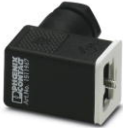
Valve connector, 4-pos., type C, unconnected, screw connection, cable screw connection Pg7

Please be informed that the data shown in this PDF Document is generated from our Online Catalog. Please find the complete data in the user's documentation. Our General Terms of Use for Downloads are valid ( http://download.phoenixcontact.com )