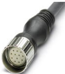
Socket M23, straight, 12-pos., with 20 m master cable

Please be informed that the data shown in this PDF Document is generated from our Online Catalog. Please find the complete data in the user's documentation. Our General Terms of Use for Downloads are valid ( http://download.phoenixcontact.com )