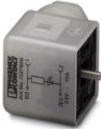
Valve connector, 3-pos., type A, 1 LED, without protective circuit, screw connection, cable screw connection Pg9

Please be informed that the data shown in this PDF Document is generated from our Online Catalog. Please find the complete data in the user's documentation. Our General Terms of Use for Downloads are valid ( http://download.phoenixcontact.com )