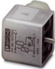
Valve connectors, 3-position, Valve connector A, with 1 LED, connected with Varistor, Screw connection, Cable gland Pg9, External cable diameter 6 mm ... 8 mm

Please be informed that the data shown in this PDF Document is generated from our Online Catalog. Please find the complete data in the user's documentation. Our General Terms of Use for Downloads are valid ( http://download.phoenixcontact.com )