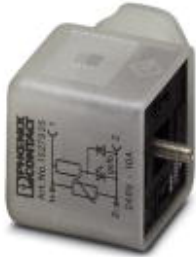
Valve connectors, 3-position, Valve connector A, with 1 LED, connected with Varistor, Screw connection, Cable gland Pg9, External cable diameter 6 mm ... 8 mm

Please be informed that the data shown in this PDF Document is generated from our Online Catalog. Please find the complete data in the user's documentation. Our General Terms of Use for Downloads are valid ( http://download.phoenixcontact.com )