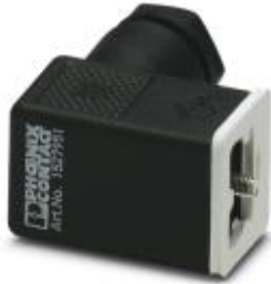
Valve connector, 3-pos., type C, unconnected, screw connection, cable screw connection Pg7

Please be informed that the data shown in this PDF Document is generated from our Online Catalog. Please find the complete data in the user's documentation. Our General Terms of Use for Downloads are valid ( http://download.phoenixcontact.com )