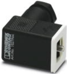
Valve connector, 3-pos., type CI, unconnected, screw connection, cable screw connection Pg7

Please be informed that the data shown in this PDF Document is generated from our Online Catalog. Please find the complete data in the user's documentation. Our General Terms of Use for Downloads are valid ( http://download.phoenixcontact.com )