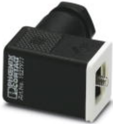
Valve connector, 4-pos., type CI, unconnected, screw connection, cable screw connection Pg7

Please be informed that the data shown in this PDF Document is generated from our Online Catalog. Please find the complete data in the user's documentation. Our General Terms of Use for Downloads are valid ( http://download.phoenixcontact.com )