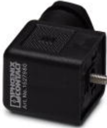
Valve connector, 3-pos., type B, unconnected, screw connection, cable screw connection Pg9

Please be informed that the data shown in this PDF Document is generated from our Online Catalog. Please find the complete data in the user's documentation. Our General Terms of Use for Downloads are valid ( http://download.phoenixcontact.com )