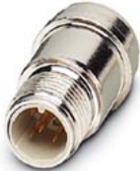
Sensor/actuator flush-type plug, 4-pos., M12, A-coded, front/press-in mounting, with straight solder connection

Please be informed that the data shown in this PDF Document is generated from our Online Catalog. Please find the complete data in the user's documentation. Our General Terms of Use for Downloads are valid ( http://download.phoenixcontact.com )