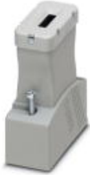
Sleeve housing, plastic, type: VC2, with 9 x 35 mm flat cable outlet, locking screws with positive/negative head,

Please be informed that the data shown in this PDF Document is generated from our Online Catalog. Please find the complete data in the user's documentation. Our General Terms of Use for Downloads are valid ( http://download.phoenixcontact.com )