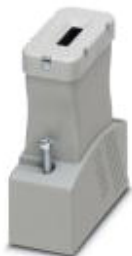
Sleeve housing, plastic, type: VC2, with 6 x 20.5 mm flat cable outlet, locking screws with positive/negative head,

Please be informed that the data shown in this PDF Document is generated from our Online Catalog. Please find the complete data in the user's documentation. Our General Terms of Use for Downloads are valid ( http://download.phoenixcontact.com )