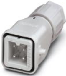
HEAVYCON QUICKON sleeve housing A3, for single locking latch, 3-pos., with PE connection, plug, QUICKON connection, straight cable outlet

Please be informed that the data shown in this PDF Document is generated from our Online Catalog. Please find the complete data in the user's documentation. Our General Terms of Use for Downloads are valid ( http://download.phoenixcontact.com )