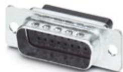
D-SUB contact carrier, shell size 2, for 26 signal contacts, contact type pin, for crimp contacts, straight, fixing with a 3 mm hole, for panel mounting frame and sleeve housing VS-15-...

Please be informed that the data shown in this PDF Document is generated from our Online Catalog. Please find the complete data in the user's documentation. Our General Terms of Use for Downloads are valid ( http://download.phoenixcontact.com )