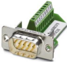
D-SUB contact insert, shell size 1, with 9 signal contacts, male contact type, screw connection, straight, for panel mounting frame and sleeve housing with IP67 protection

Please be informed that the data shown in this PDF Document is generated from our Online Catalog. Please find the complete data in the user's documentation. Our General Terms of Use for Downloads are valid ( http://download.phoenixcontact.com )