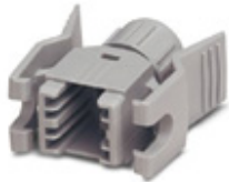
RJ45 sleeve housing IP20, for pin insert VS-08-ST-RJ45, with push-pull interlocking for panel mounting frames, for cable cross section 5.0 mm ... 6.5 mm

Please be informed that the data shown in this PDF Document is generated from our Online Catalog. Please find the complete data in the user's documentation. Our General Terms of Use for Downloads are valid ( http://download.phoenixcontact.com )