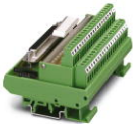
VARIOFACE module, with screw connection and D-Subminiature socket strip, for mounting on NS 35/7.5 or NS 32, with light indicator, 9-pos.

Please be informed that the data shown in this PDF Document is generated from our Online Catalog. Please find the complete data in the user's documentation. Our General Terms of Use for Downloads are valid ( http://download.phoenixcontact.com )