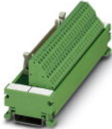
VARIOFACE module, with spring-cage connection and flat-ribbon cable connector, for mounting on NS 35/7.5, 14-pos.

Please be informed that the data shown in this PDF Document is generated from our Online Catalog. Please find the complete data in the user's documentation. Our General Terms of Use for Downloads are valid ( http://download.phoenixcontact.com )