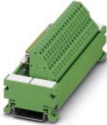
VARIOFACE module, with spring-cage connection and D-Subminiature pin strip, for mounting on NS 35/7.5, 37-pos.

Please be informed that the data shown in this PDF Document is generated from our Online Catalog. Please find the complete data in the user's documentation. Our General Terms of Use for Downloads are valid ( http://download.phoenixcontact.com )