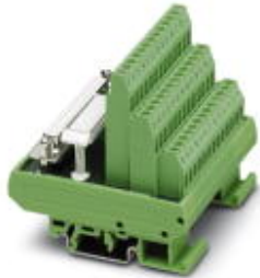
VARIOFACE module, with screw connection and D-Subminiature socket strip, for mounting on NS 35/7.5 or NS 32, 37-pos.

Please be informed that the data shown in this PDF Document is generated from our Online Catalog. Please find the complete data in the user's documentation. Our General Terms of Use for Downloads are valid ( http://download.phoenixcontact.com )