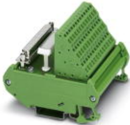
VARIOFACE module, with spring-cage connection and D-Subminiature socket strip, for mounting on NS 35/7.5 or NS 32, 37-pos.

Please be informed that the data shown in this PDF Document is generated from our Online Catalog. Please find the complete data in the user's documentation. Our General Terms of Use for Downloads are valid ( http://download.phoenixcontact.com )