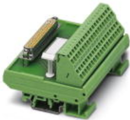
Standard 1:1 D-SUB module, with spring-cage connection and D-SUB socket strip, no. of positions 15

Please be informed that the data shown in this PDF Document is generated from our Online Catalog. Please find the complete data in the user's documentation. Our General Terms of Use for Downloads are valid ( http://download.phoenixcontact.com )