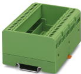
Electronic housing, for PCB insertion, without screw connection terminal blocks and cover

Please be informed that the data shown in this PDF Document is generated from our Online Catalog. Please find the complete data in the user's documentation. Our General Terms of Use for Downloads are valid ( http://download.phoenixcontact.com )