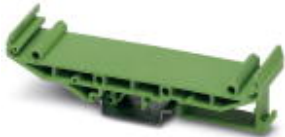
Base element with snap-on foot, for mounting on NS 32 or NS 35/7.5 DIN rail, with ribs, L = 35 mm

Please be informed that the data shown in this PDF Document is generated from our Online Catalog. Please find the complete data in the user's documentation. Our General Terms of Use for Downloads are valid ( http://download.phoenixcontact.com )