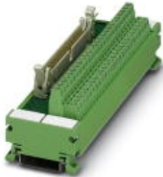
VARIOFACE module, with screw connection and flat-ribbon cable connector, for assembly on NS 35/7.5, 20 positions

Please be informed that the data shown in this PDF Document is generated from our Online Catalog. Please find the complete data in the user's documentation. Our General Terms of Use for Downloads are valid ( http://download.phoenixcontact.com )