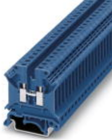
Feed-through terminal block, Connection method: Screw connection, Cross section: 0.2 mm 2 - 6 mm 2 , AWG: 24 - 10, Width: 6.2 mm, Color: blue, Mounting type: NS 35/7,5, NS 35/15, NS 32

Please be informed that the data shown in this PDF Document is generated from our Online Catalog. Please find the complete data in the user's documentation. Our General Terms of Use for Downloads are valid ( http://download.phoenixcontact.com )