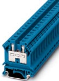
Feed-through terminal block, Connection method: Screw connection, Cross section: 0.5 mm 2 - 10 mm 2 , AWG: 20 - 8, Width: 8.2 mm, Color: blue, Mounting type: NS 35/7,5, NS 35/15

Please be informed that the data shown in this PDF Document is generated from our Online Catalog. Please find the complete data in the user's documentation. Our General Terms of Use for Downloads are valid ( http://download.phoenixcontact.com )