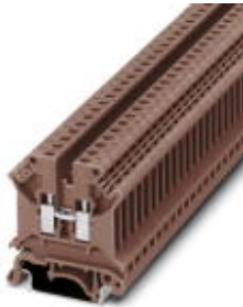
Feed-through terminal block, Connection method: Screw connection, Cross section: 0.2 mm 2 - 6 mm 2 , AWG: 24 - 10, Width: 6.2 mm, Color: brown, Mounting type: NS 35/7,5, NS 35/15, NS 32

Please be informed that the data shown in this PDF Document is generated from our Online Catalog. Please find the complete data in the user's documentation. Our General Terms of Use for Downloads are valid ( http://download.phoenixcontact.com )