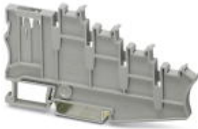
Flange, Length: 105.6 mm, Width: 5.2 mm, Color: gray

Please be informed that the data shown in this PDF Document is generated from our Online Catalog. Please find the complete data in the user's documentation. Our General Terms of Use for Downloads are valid ( http://download.phoenixcontact.com )