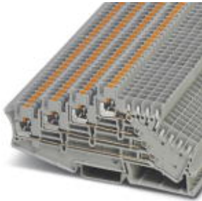
Multi-level terminal block, Connection method: Push-in connection, Cross section: 0.14 mm 2 - 4 mm 2 , AWG: 26 - 12, Width: 5.2 mm, Color: gray, Mounting type: NS 35/7,5, NS 35/15

Please be informed that the data shown in this PDF Document is generated from our Online Catalog. Please find the complete data in the user's documentation. Our General Terms of Use for Downloads are valid ( http://download.phoenixcontact.com )