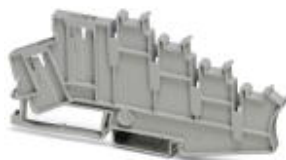
Flange, Length: 125 mm, Width: 5.2 mm

Please be informed that the data shown in this PDF Document is generated from our Online Catalog. Please find the complete data in the user's documentation. Our General Terms of Use for Downloads are valid ( http://download.phoenixcontact.com )