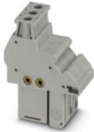
Plug, 3-pos. with integrated, automatic short circuit function

Please be informed that the data shown in this PDF Document is generated from our Online Catalog. Please find the complete data in the user's documentation. Our General Terms of Use for Downloads are valid ( http://download.phoenixcontact.com )